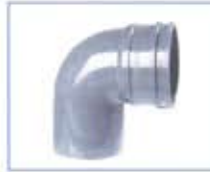
BEND - 87.5°