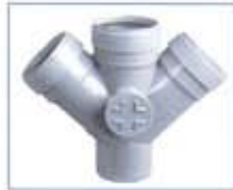
DOUBLE 'Y' WITH DOOR