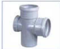
SINGLE 'T' WITH DOOR