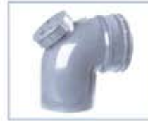
BEND - 87.5° WITH DOOR