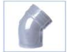
BEND - 45°