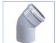
BEND - 45°