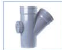
SINGLE 'Y' WITH DOOR