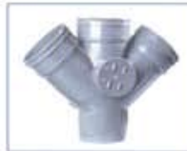
DOUBLE 'Y' WITH DOOR