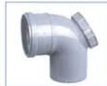
BEND - 87.5° WITH DOOR