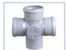
DOUBLE 'T' WITH DOOR