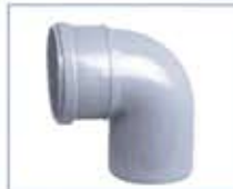
BEND - 87.5°