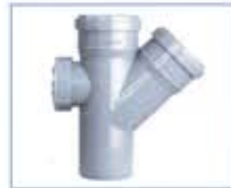
SINGLE 'Y' WITH DOOR