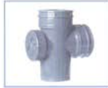
SINGLE 'T' WITH DOOR